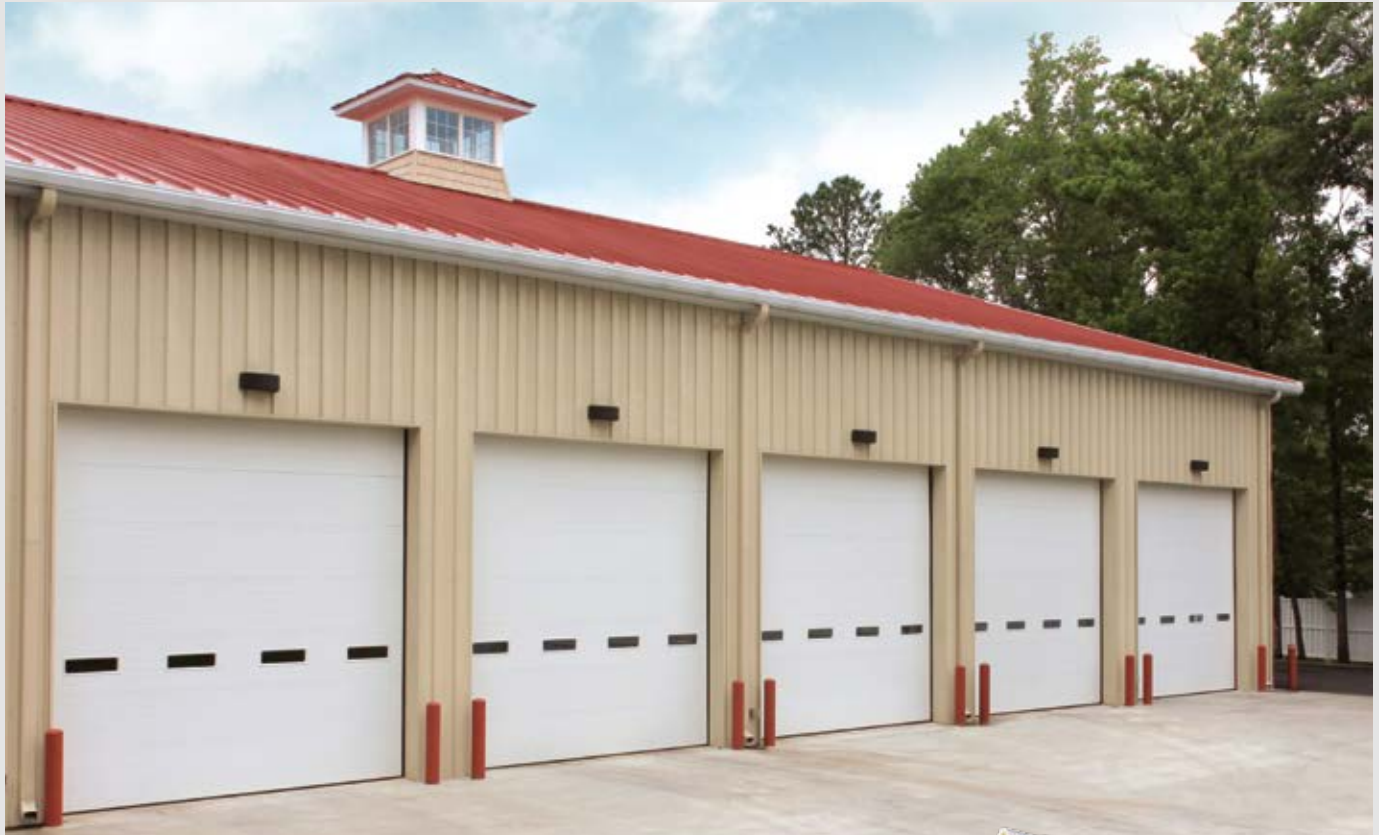
Model 3724, 14'2" x 14' doors, shown with 24" x 8" Lites