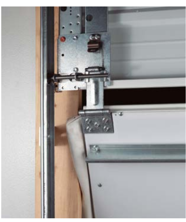
Inside View of Single Bottom Section

Clopay's break-away bottom sections will release from the track and swing up to a full 45° angle inward or outward, preventing further damage to the door. The cable attachment at the bottom of the second or third section enables the door to continue operating after being struck. The bottom sections can be snapped back into place in less than a minute. The bottom sections have a fiberglass or polycarbonate sheet on the inside of the sections to resist dents and maintain an attractive appearance. These sections are available on the 1-3/4" (44.5 mm) and 2" (50.8 mm) thick 3000 Series polystyrene and polyurethane insulated doors, and on all 520 and 524 Series ribbed steel doors.