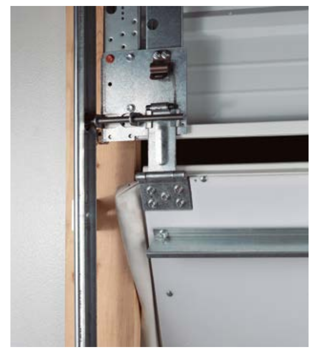
Inside View of Single Bottom Section

Clopay's break-away bottom sections will release from the track and swing up to a full 45° angle inward or outward, preventing further damage to the door. The cable attachment at the bottom of the second or third section enables the door to continue operating after being struck. The bottom sections can be snapped back into place in less than a minute. The bottom sections have a fiberglass or polycarbonate sheet on the inside of the sections to resist dents and maintain an attractive appearance. These sections are available on the 1-3/4" (44.5 mm) and 2" (50.8 mm) thick 3000 Series polystyrene and polyurethane insulated doors, and on all 520 and 524 Series ribbed steel doors.