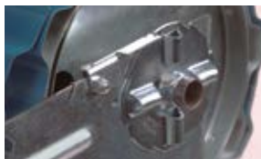
RATCHET SPRING TENSION ASSEMBLY