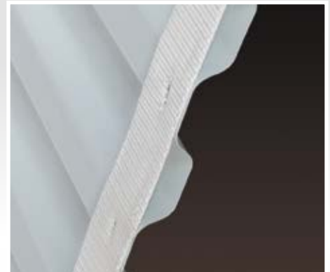
Corrugated Panel Design (Model 157C Shown)