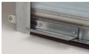
SLIDE BOLT LOCK