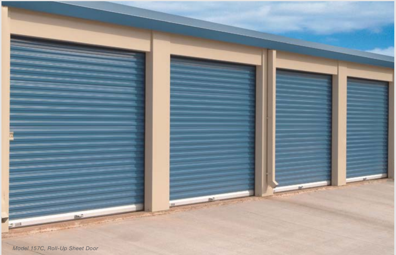
Model 157C, Roll-Up Sheet Door