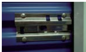
LOCK MINI LATCH

Maximum Height – 14' (150C, 157C) 18' (160C).