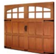
RESERVE® WOOD collection SEMI-CUSTOM SERIES LIMITED EDITION SERIES CUSTOM SERIES MODERN SERIES

*Avante® Collection doors use heavy-duty hinges without QuietFlex™ technology.