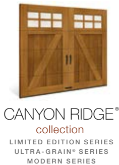
CANYON RIDGE® collection LIMITED EDITION SERIES ULTRA-GRAIN® SERIES MODERN SERIES

QuietFlex™ hinge is not available on all door heights.