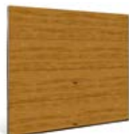
MODERN STEEL™ collection