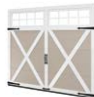
GRAND HARBOR® collection