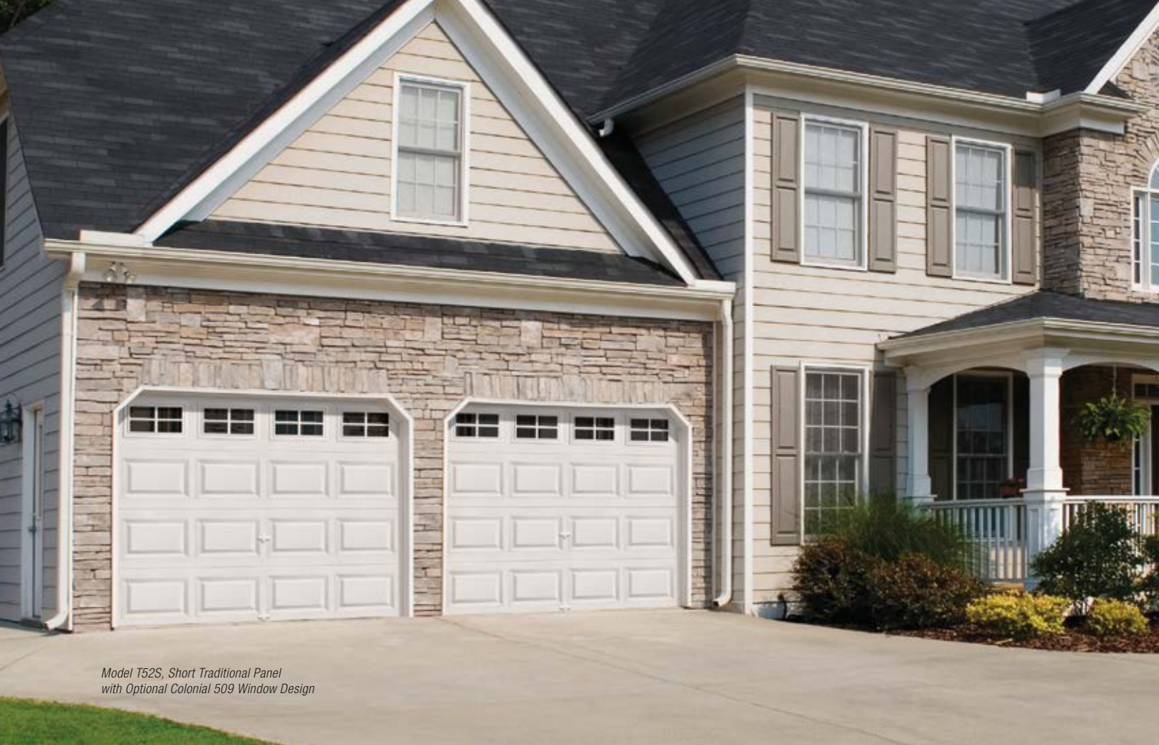
Model T52S, Short Traditional Panel with Optional Colonial 509 Window Design