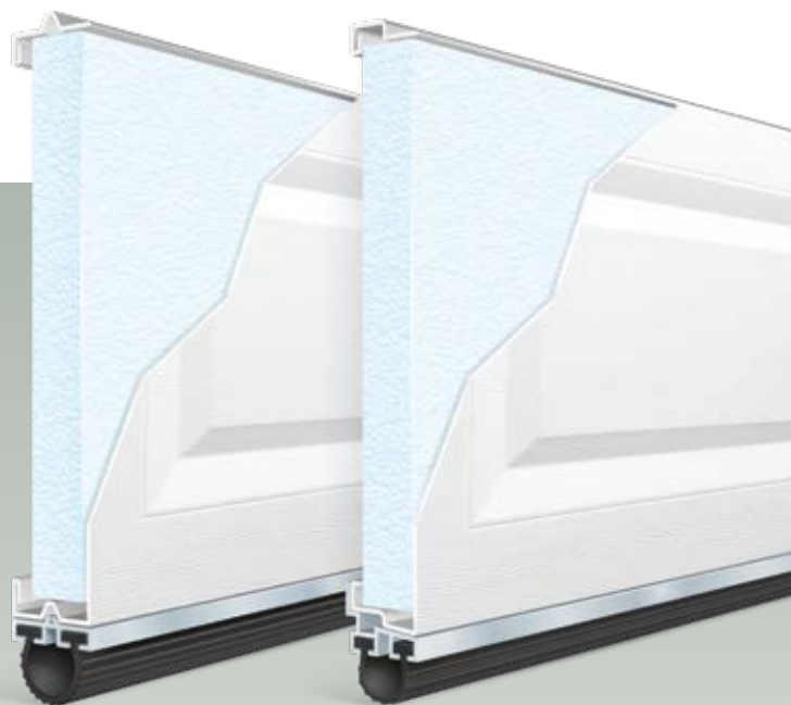
Tongue-and-Groove Section Joints

24 GAUGE STEEL T42S short panel T42L long panel