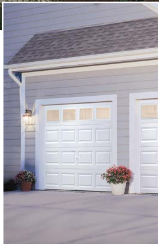
Model T42S, Short Traditional Panel with Plain Short Windows