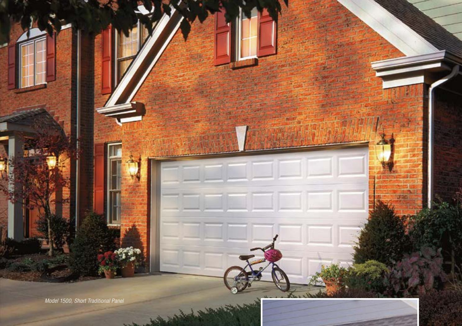
Model 1500, Short Traditional Panel