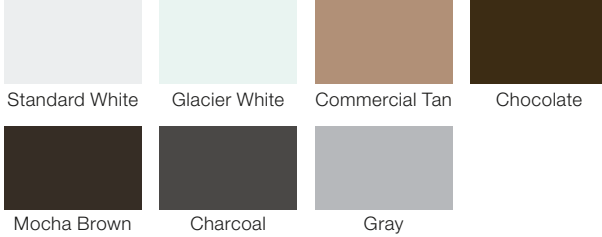
Standard White Glacier White Commercial Tan Chocolate Mocha Brown Charcoal Gray

Due to the printing process, colors may vary.