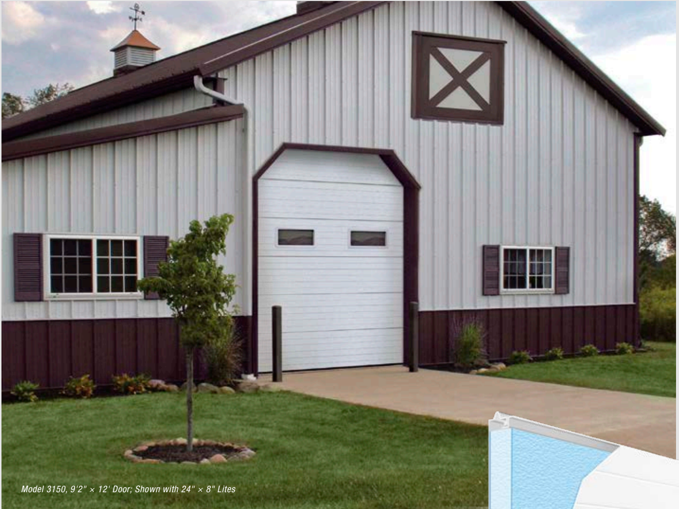
Model 3150, 9'2" x 12' Door; Shown with 24" x 8" Lites