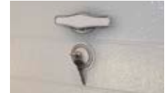
Outside keyed lock